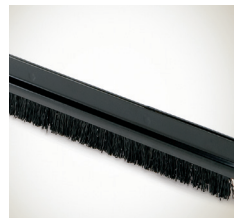
FINE BRISTLE BRUSH