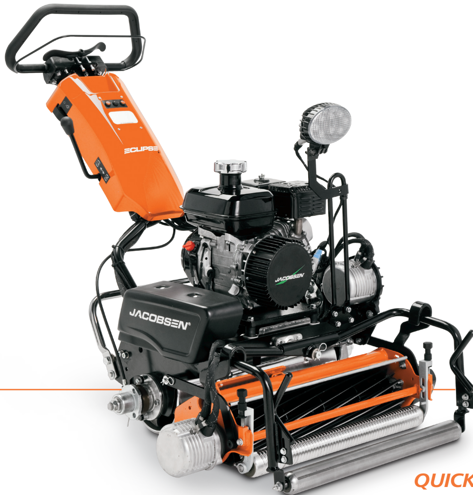
ECLIPSE ® 2 122F

Jacobsen's new ECLIPSE ® 2 offers best in class quality of cut, industry leading productivity and customized controls.